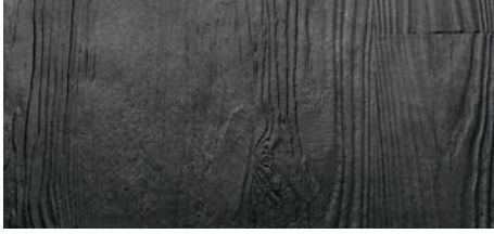
IRON WOOD D.STR.E.816