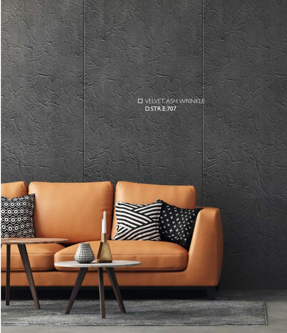
□ VELVET ASH WRINKLE D.STR.E.707

Please consider the nap direction of the surface before further processing in product installation. If design panels are not installed in the same direction, there will be a visual color difference.