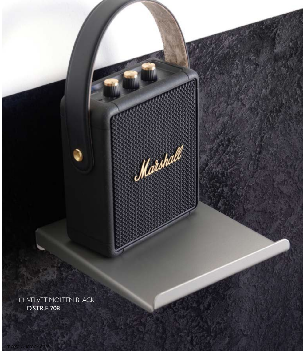
□ VELVET MOLTEN BLACK D.STR.E.708

Please consider the nap direction of the surface before further processing in product installation. If design panels are not installed in the same direction, there will be a visual color difference.