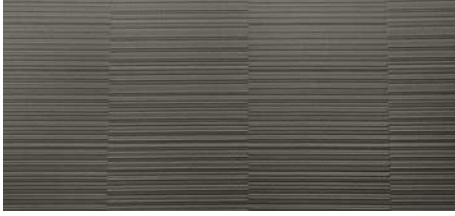
SMOKE STRIPES D.STR.E.828