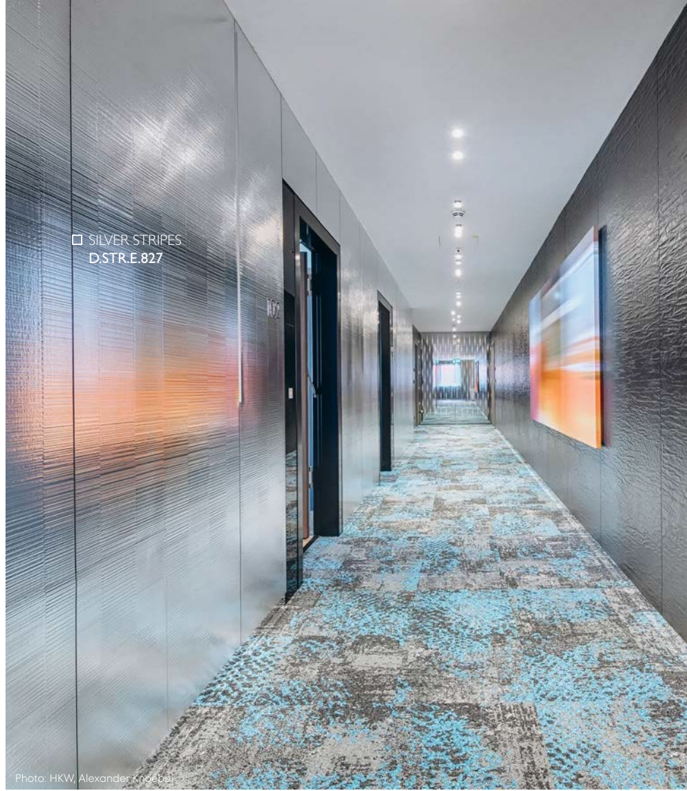
□ SILVER STRIPES D.STR.E.827