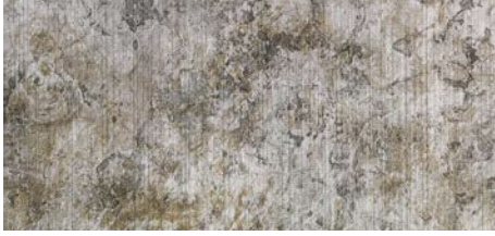
RUSTED SILVER D.STR.E.574