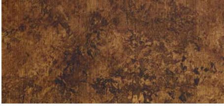
RUSTED COPPER D.STR.E.573