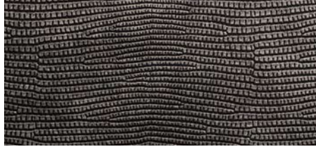
DARK LUXE LEATHER D.STR.E.545