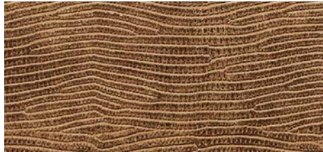
BRASS LUXE LEATHER D.STR.E.543