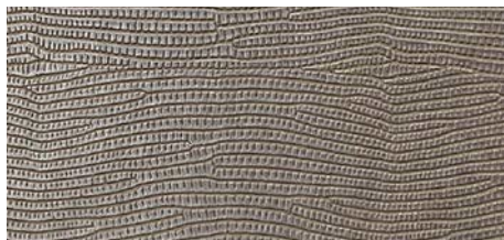
SILVER LUXE LEATHER D.STR.E.547