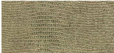
GOLD LUXE LEATHER D.STR.E.544