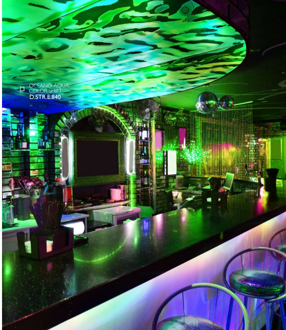
OCEANO AQUA - COLOR SHIFT D.STR.E.840

Due to the pattern, mechanical assembly (screws, spacers) is generally recommended. Applications in the ceiling area must be attached mechanically.