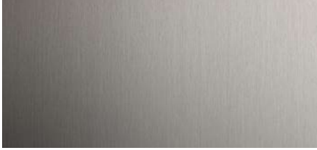
BRUSHED MISTY SILVER D.STR.E.751