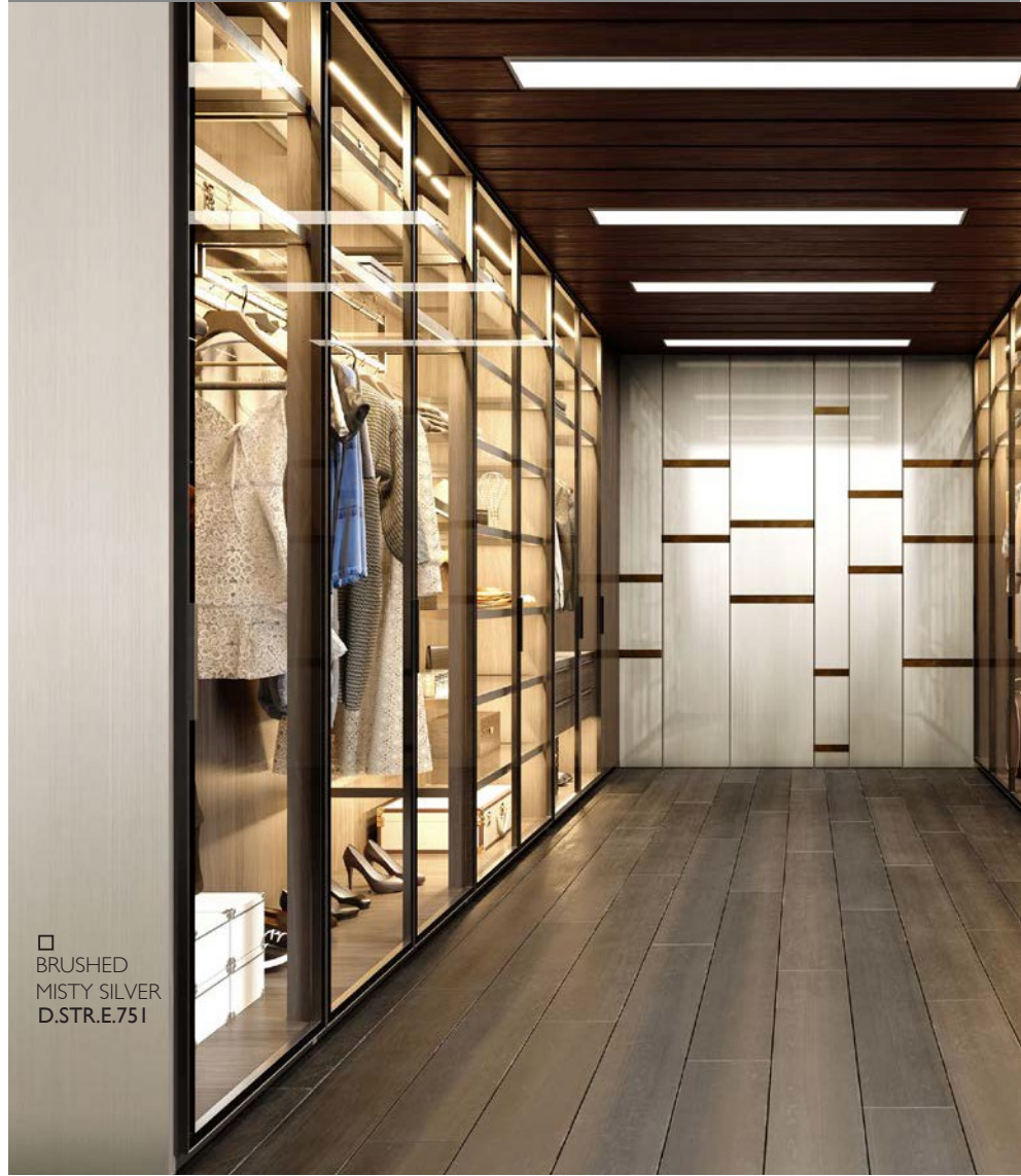
BRUSHED MISTY SILVER D.STR.E.751