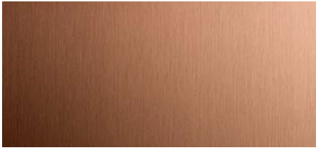
BRUSHED COPPER D.STR.E.732