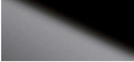
FASHION GRAY D.STR.E.743