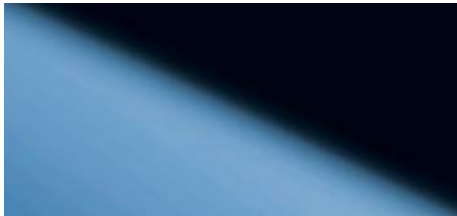
ICE BLUE D.STR.E.603