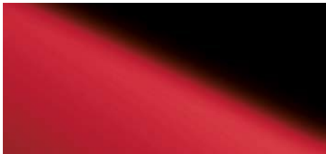
FASHION RED D.STR.E.749