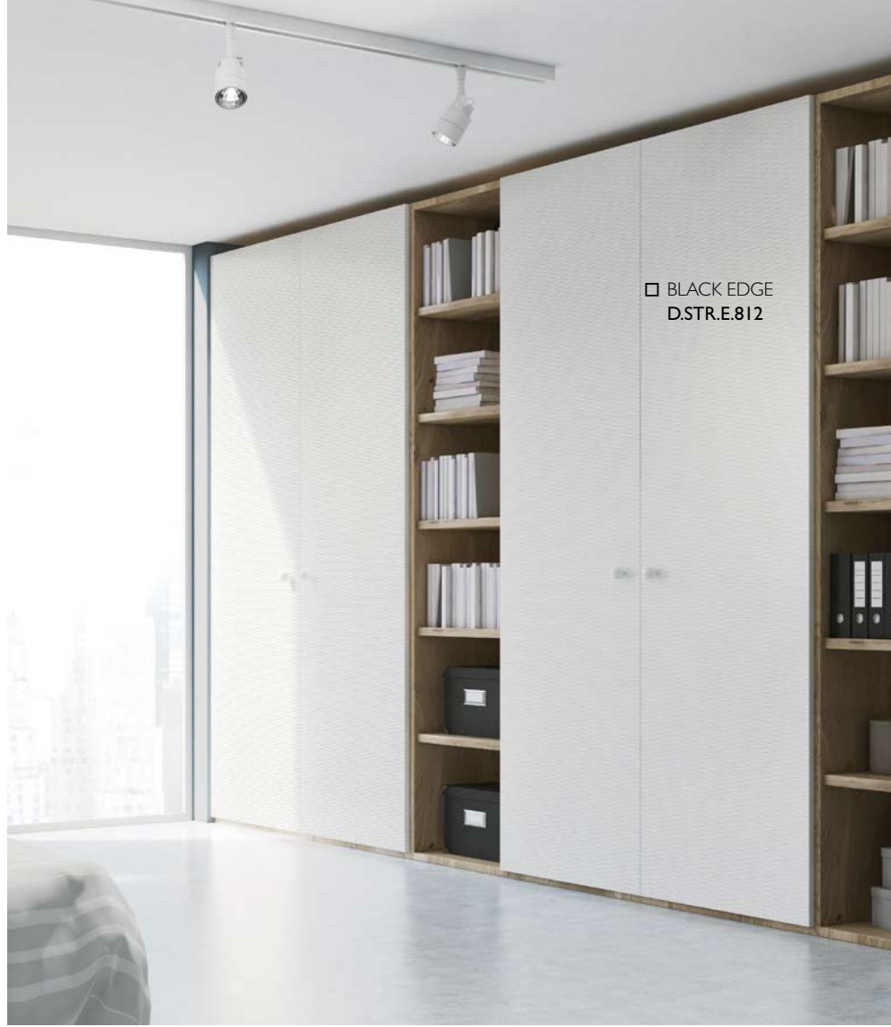
□ BLACK EDGE D.STR.E.812