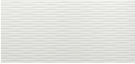
WHITE EDGE D.STR.E.812