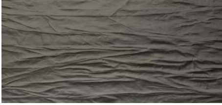
SMOKE DISTORTION D.STR.E.817