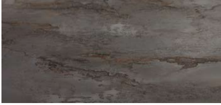
GRAY STONE D.STR.E.618