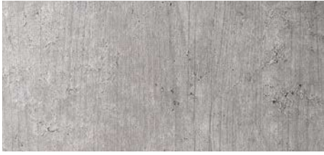
GRAY CEMENT D.STR.E.501