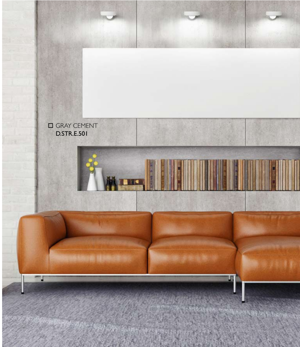
□ GRAY CEMENT D.STR.E.501