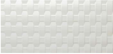
WHITE CHAIN D.STR.E.823