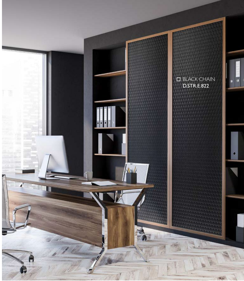
BLACK CHAIN D.STR.E.822